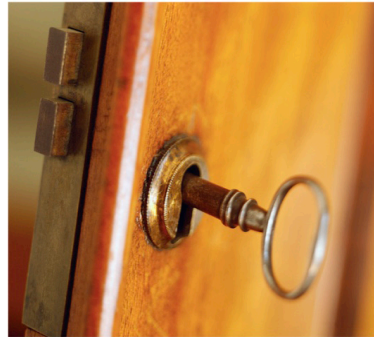
Sexual sobriety opens the door to recovery. (SA, 33)

You are invited in this week to express your gratitude towards SAICO and donate online directly to SAICO. All the money raised goes straight towards carrying the message to the newcomer.